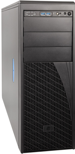
Nobilis i1084TW Tower Server