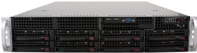
i1076R2 2U Rackmount Server