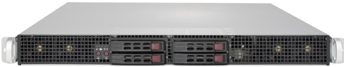
i2090R1 1U GPU server